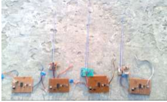
Fig.3 Four Sensing units with individual Transmitters